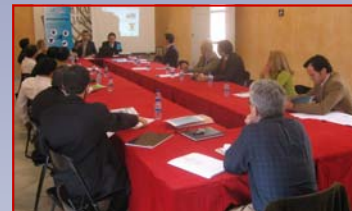
April 7 th 2006. Second Meeting of the Valencian Region Working Group.