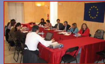
January 17 th 2006. First Meeting of the Valencian Region Working Group